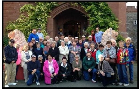
The Good Neighbor Club visits England.

Collette's worldwide travel collection features comprehensive land tours, river cruises, rail journeys, small group tours, garden holidays and more. They offer incredible destinations across all seven continents. Heritage Clubs International is