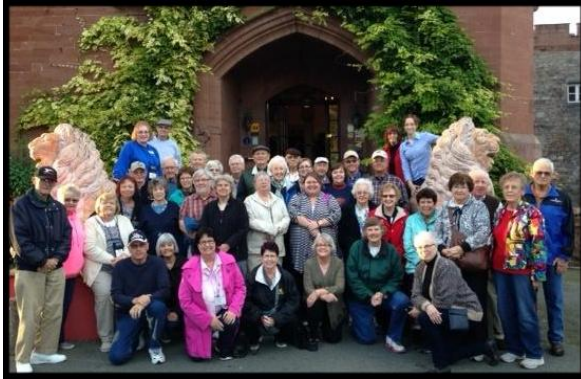
The Good Neighbor Club visits England.

Collette's worldwide travel collection features comprehensive land tours, river cruises, rail journeys, small group tours, garden holidays and more. They offer incredible destinations across all seven continents. Heritage Clubs International is proud to have Collette as one of its Preferred Tour Operators.