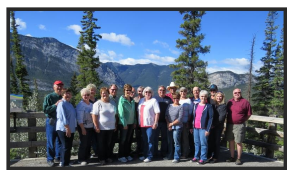
The Ambassador Club tours the Canadian Rockies