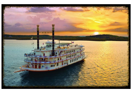
Branson Belle Showboat

<u>Ozarks' Kirkwood Tour & Travel</u> Joy Penrod, Angie Greeno Branson, MO 800.848.5432