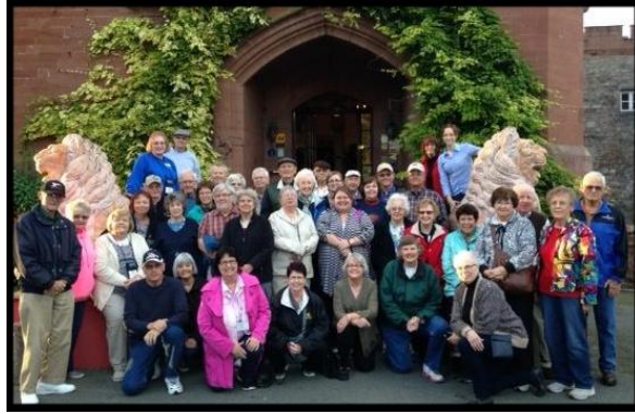
The Good Neighbor Club visits England.

Collette's worldwide travel collection features comprehensive land tours, river cruises, rail journeys, small group tours, garden holidays and more. They offer incredible destinations across all seven continents. Heritage Clubs International is proud to have Collette as one of its Preferred Tour Operators.